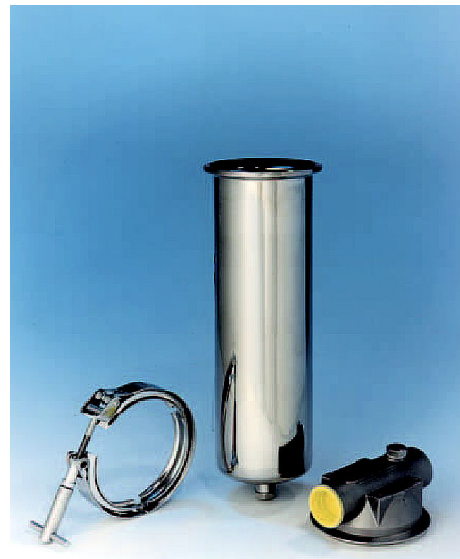
Industrial Grade Housing

Since operating conditions vary considerably between applications, verification by users for particular processes is recommended.