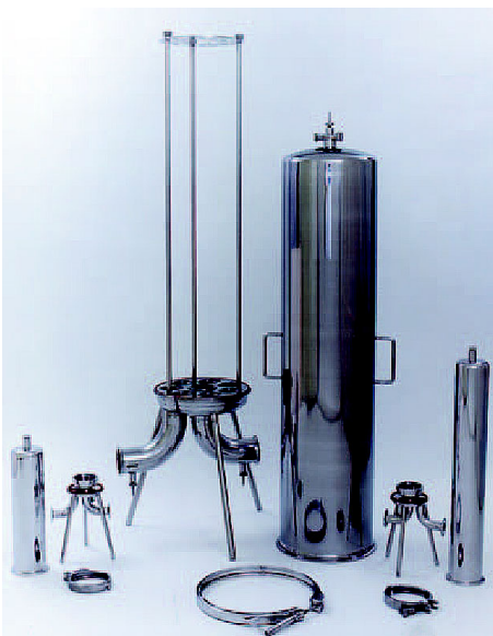
Sanitary Grade Housing