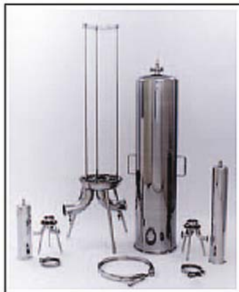
Sanitary Grade Housing